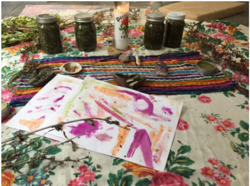
Herbal Workshop with Antonia Perez, Installation shot